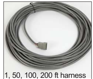
1, 50, 100, 200 ft harness

Compatibility: RS13A, RS13AC, RS14AF, RS20A or RS20AC generators and the RSS transfer switch models.