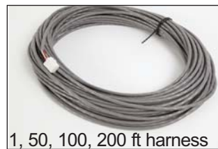
1, 50, 100, 200 ft harness

The 1 ft harness allows display of your wires to the pig tail. Compatibility: RS13A, RS13AC, RS14AF, RS20A, RS20AC