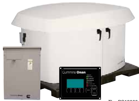
RSS Transfer Switch