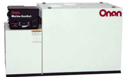
Onan Optional Sound Shield