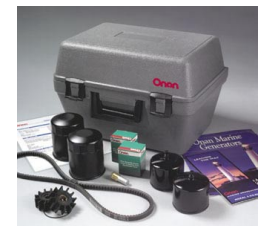
Optional Cruise Kit