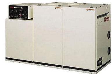
Onan Optional Sound Shield