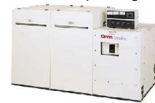
Onan Optional Sound Shield