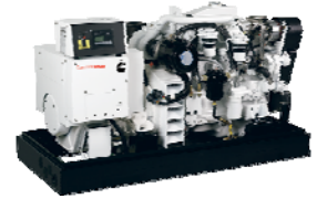
Standard model without sound shield