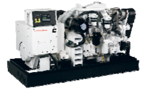
Standard model without sound shield